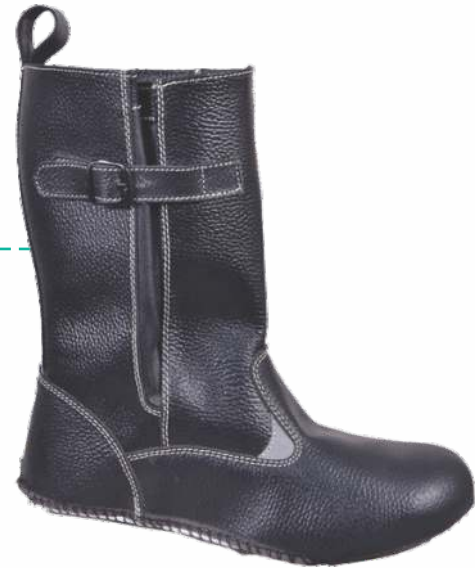
Leather - Split Barton Black Lining - Unlined Thickness - 1.6 - 1.8 mm