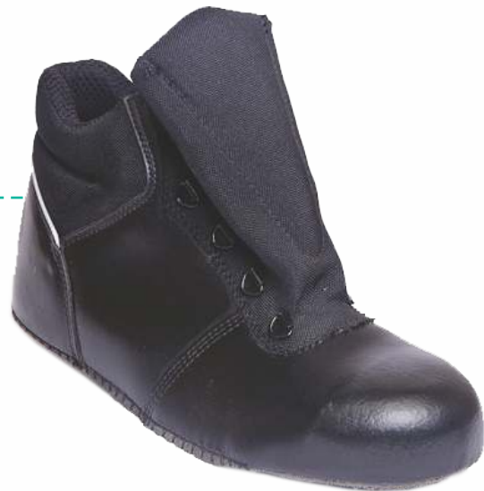
Leather - Buff Black CG Lining - Black Spacer Thickness - 1.8 - 2.0 mm