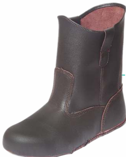
Leather - Buff Brown CG Lining - Unlined Thickness - 1.8 - 2.0 mm