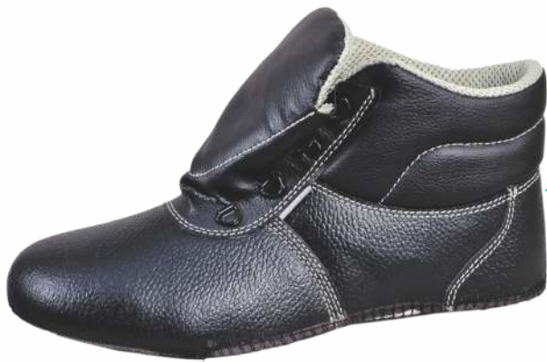
Leather - Split Barton Black Lining - Spacer Grey Thickness - 1.6 - 1.8 mm